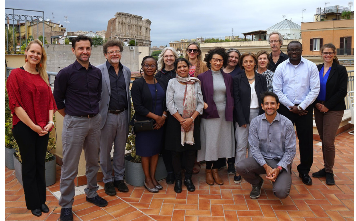
GFEP meeting participants.

Listen to three of the panel members in this: VIDEO Find out more about the panel and its activities: HERE