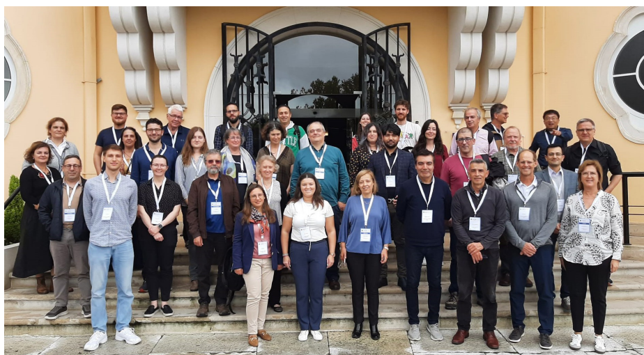
Conference participants.

The Optimization and Wildfire Conference (O&W) brought together researchers and practitioners who develop and/or use operational research and decision-making methods including optimization models and solution approaches for wildfire-related decision problems. It reported the state-of-