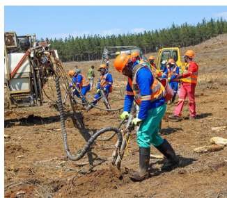
Demonstration of semi-mechanized planting using a tractor mounted rig.

Website: https://www.modernsilviculturesymposium.co.za/