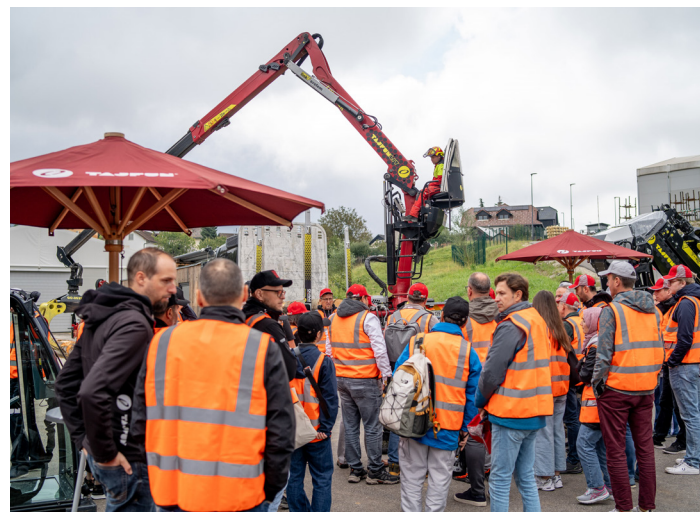
Technical excursion at Tajfun Company in Sevnica, Slovenia.