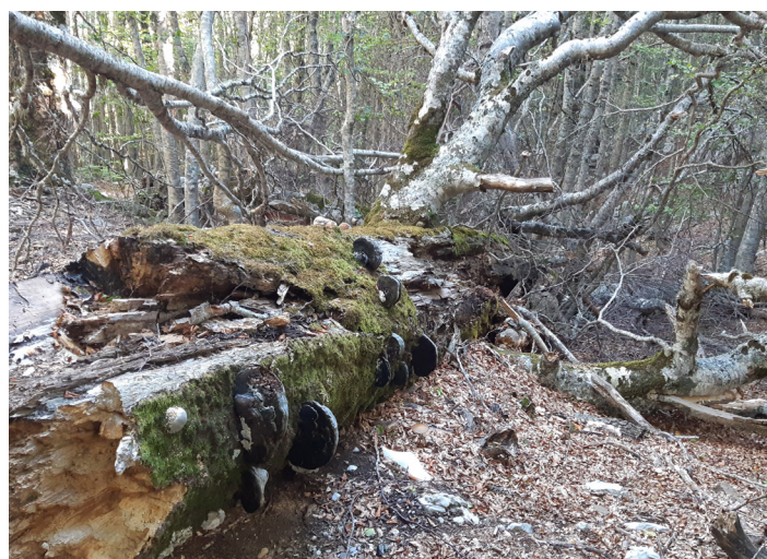
Lying deadwood in old-growth beech forest.

The final conference of the LIFE+ PROGNOSSES project brought together leading scientists, policymakers at the European level, and national experts in the field of forest management and conservation. Based on the insights gained in the PROGNOSSES project, participants discussed means and methods to implement the EU regulation on the strict protection of all primary and old-growth forests in Europe.