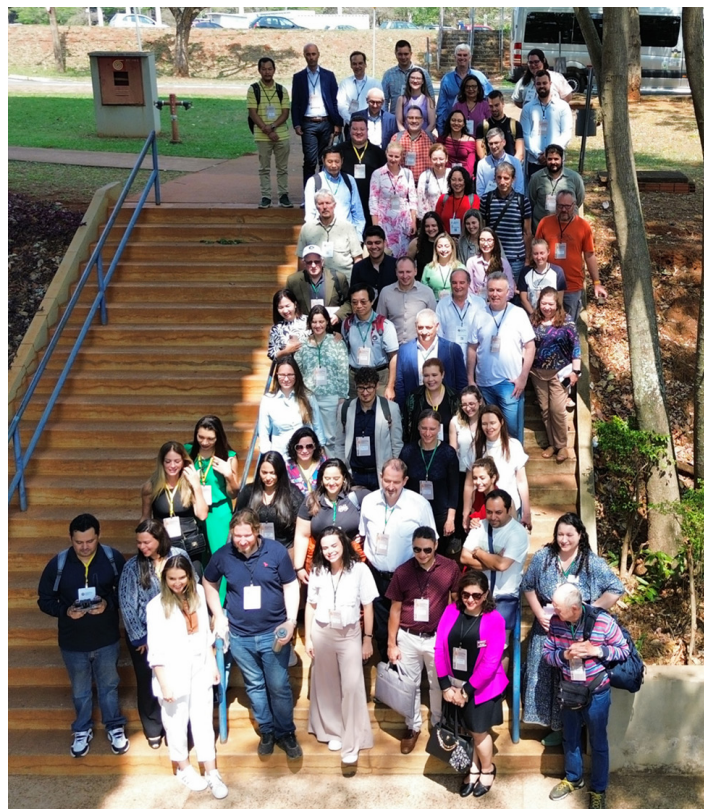
Participants of the 23rd International NDTE of Wood Symposium in Campinas, São Paulo, Brazil.

A total of 81 scientists, technology developers, practitioners, and students from 18 countries (Australia, Brazil, China, Croatia, Estonia, Germany, Hungary, Iran, Italy, Japan, Portugal, Russian Federation, Slovenia, Spain, Switzerland, Uruguay, United States, and Vietnam) attended the event (Photo 1). In addition to the general session, the program included five technical sessions and