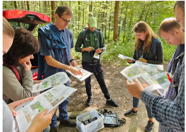
Photo of Training School participants

Designed to build capacity for early-career Ukrainian professors, the Training School addressed priority actions identified by Ukrainian forestry scientists, students, and experts at the " IUFRO Forum on Ukraine Forest Science and Education: Needs and Priorities for Collaboration " (2023). These actions include strengthening forest science to support evidence-based post-war forest recovery strategies, updating forestry education, and building international partnerships and enhancing collaboration.